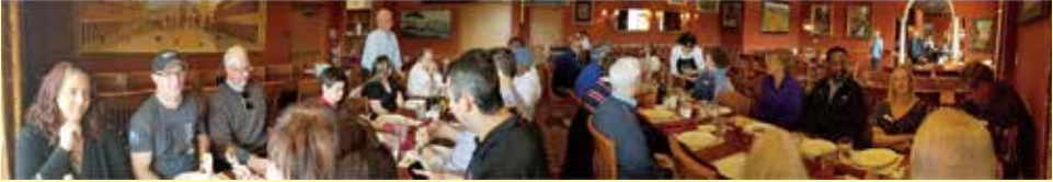
February 8, 2020 Williamsburg, VA

Our annual Valentine's Day Drive in Williamsburg always adjourns with an Italian feast!