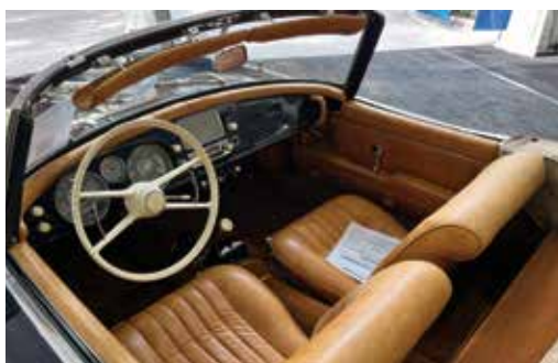
at The Amelia 2023