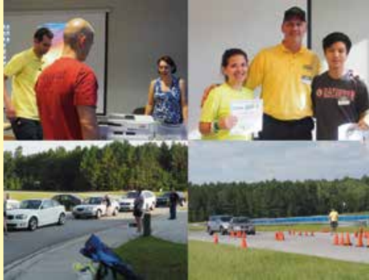
September 15, 2019 NC CAR, Garysburg, NC

Our intent is for you to recall events that you have participated in and remember the good times we shared and the other members. Despite the weather, our young driving students really got a lot out of the day & thanks to our volunteers who made this terrific public service event possible!