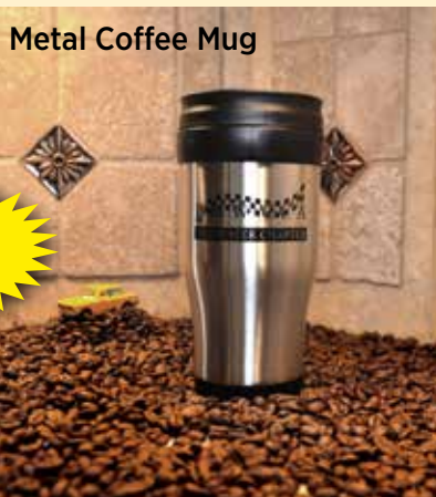
Metal Coffee Mug