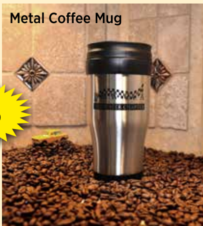
Metal Coffee Mug