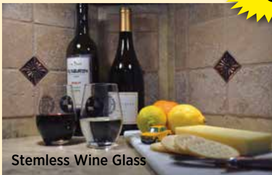
Stemless Wine Glass