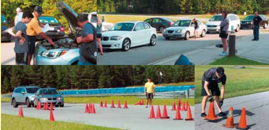
September 15th, 2019 Tire Rack Street Survival, Garysburg, NC

Our intent is for you to recall events that you have participated in and remember the good times we shared and the other members. Despite the weather, our young driving students really got a lot out of the day & thanks to our volunteers who made this terrific public service event possible!