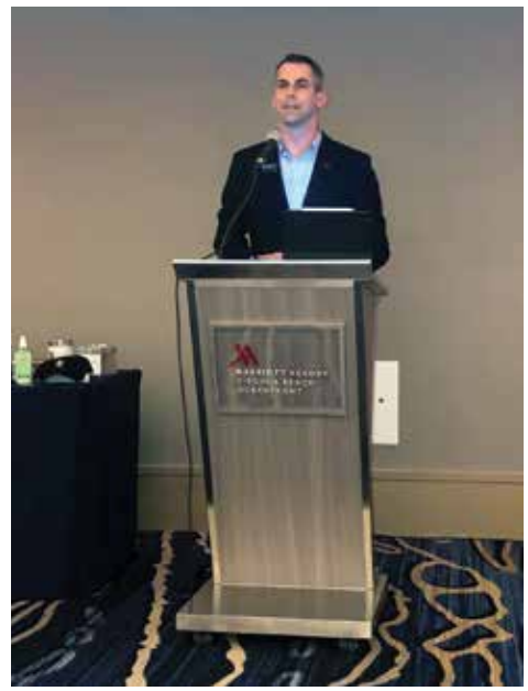
50th Anniversary Annual Banquet